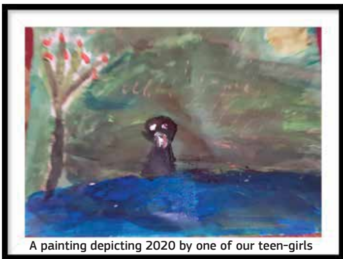
A painting depicting 2020 by one of our teen-girls

The year 2020 was unlike any other year. It was a strange year for the whole globe, but for Lebanon, it was an exceptional year. The country is collapsing financially, politically, socially and the Covid-19 crisis has added more chaos. However, for Together, for the Family 2020 was a year of opportunities to bring hope and light in the midst of distress and darkness. Please join me in offering praise to God as you read our newsletter. I would also like to take this opportunity to warmly thank you for your support and prayers.